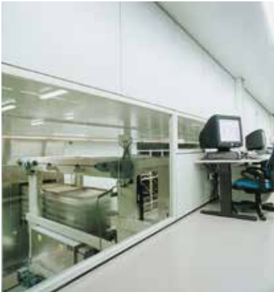
Automated autoclave control room