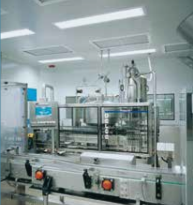
Automated filling of intravenous solutions in glass vials