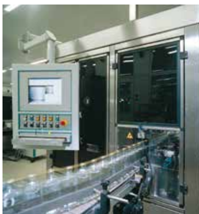
Automatic particle inspection system by artificial vision