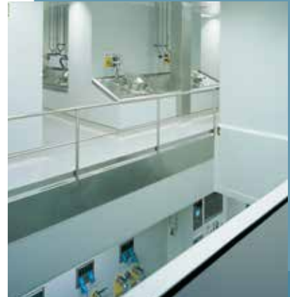
Minimization of cleanroom areas