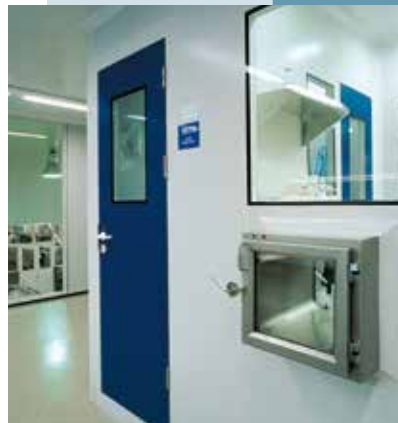
In Process Control Analysis in the production plants