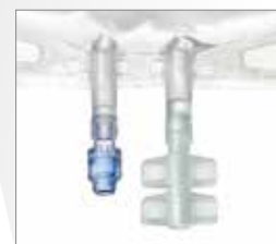
New PP Bag with Luer Valve