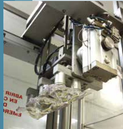
Automated machine for manufacturing protective overwrapping

Three new Form-Fill Seal lines, two of which are fully automated, have been designed to manufacture 50 ml, 100 ml, 250 ml, 500 ml and 1000 ml, PP bags, and can be adapted to manufacture special sizes depending on customer specifications.