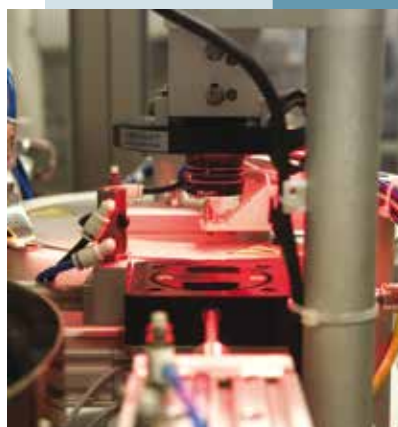
Automated inspection of components by artificial vision