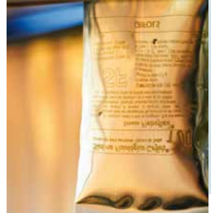
Automated filling of intravenous solutions in PP bags